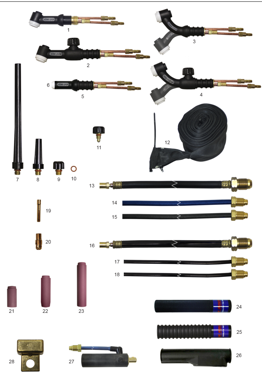
20 Series Torch Packages, 250 Amp